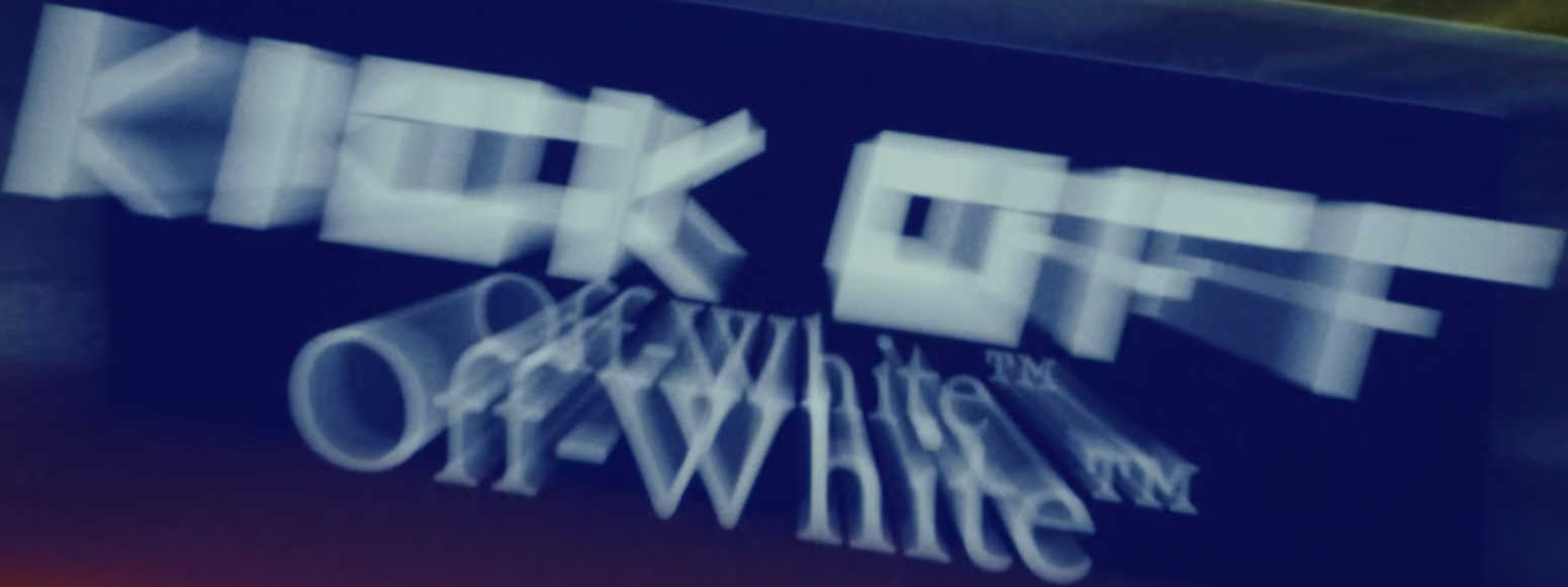
“Kick Off” Sneaker