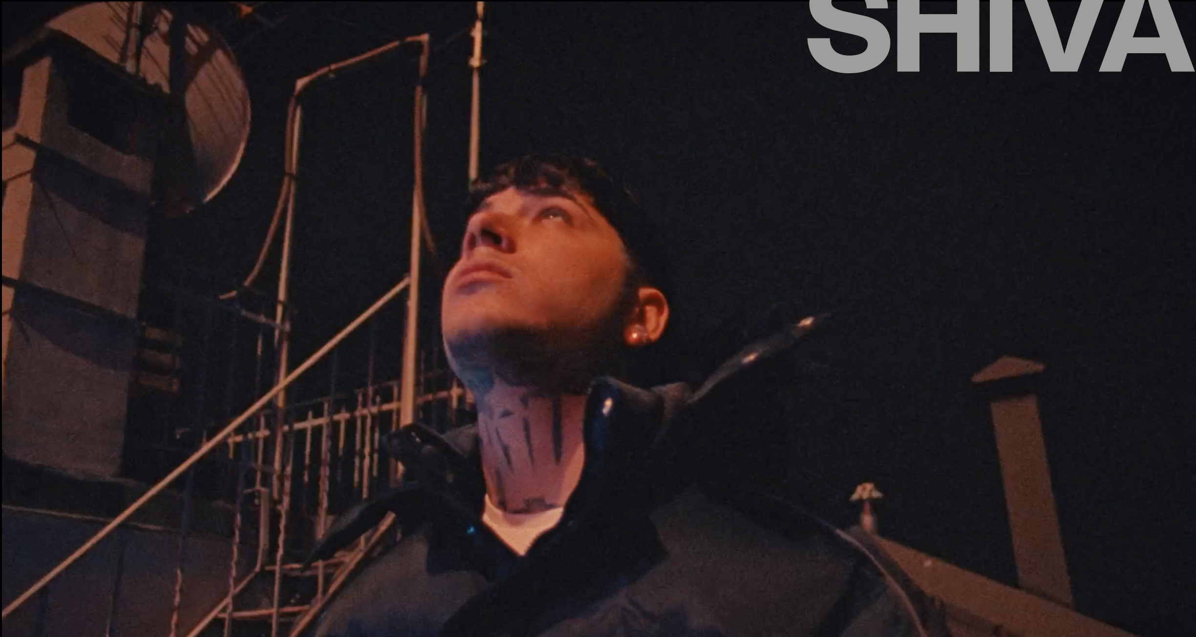
“Ride or Die” Trailer