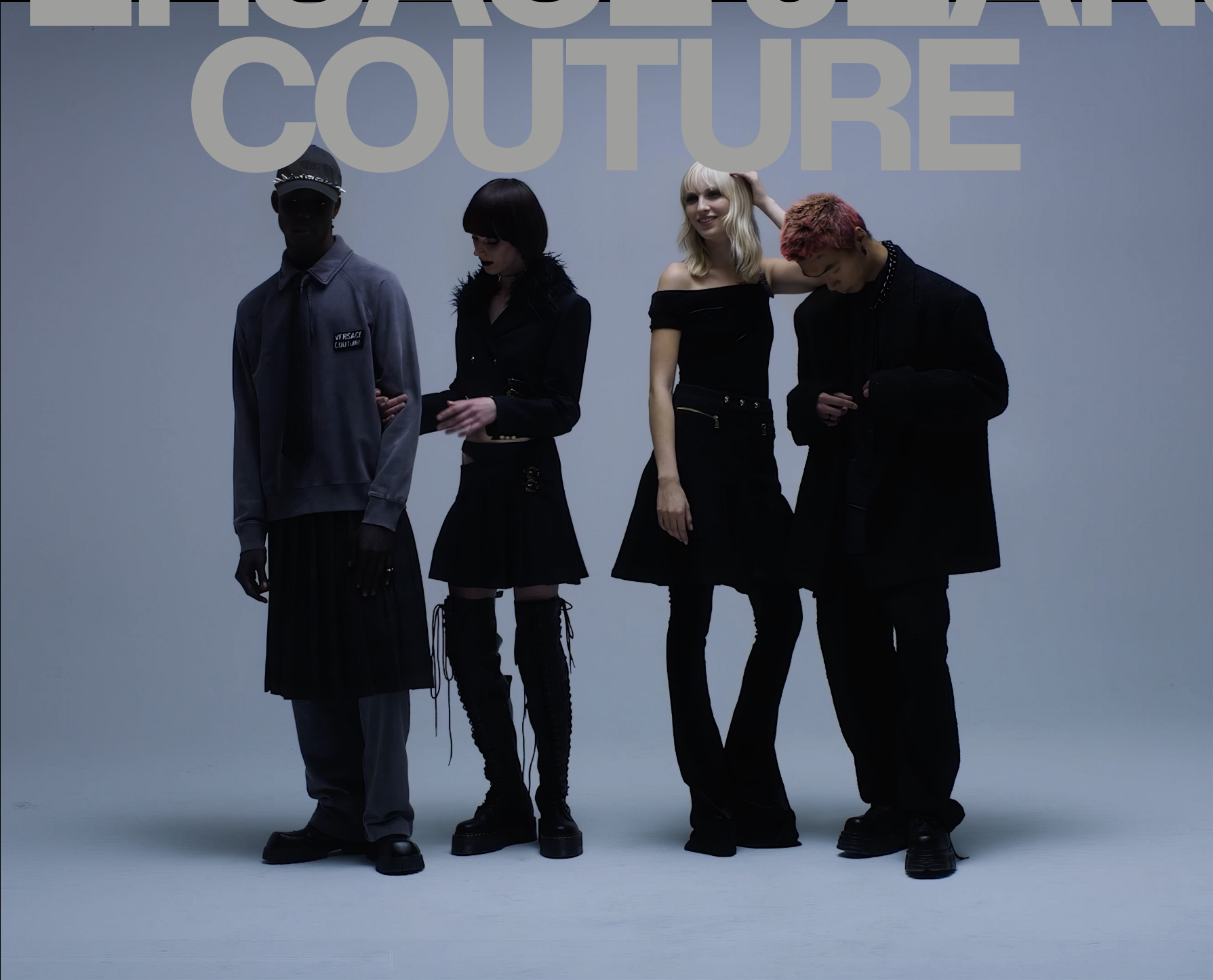
FW24 Behind The Scenes Campaign